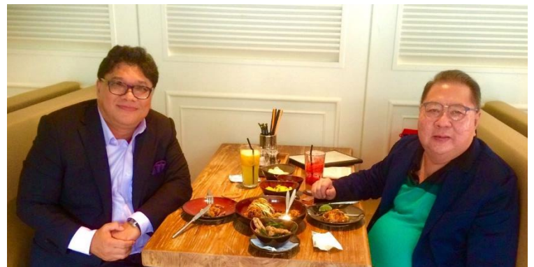
Both sharing a meal at Island Café @ Tangs